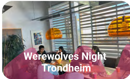
Werewolves Night Trondheim