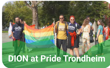
DION at Pride Trondheim