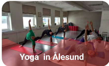
Yoga in Ålesund