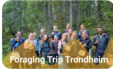
Foraging Trip Trondheim