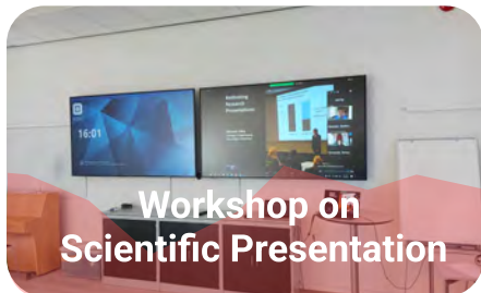
Workshop on Scientific Presentation