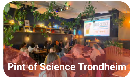
Pint of Science Trondheim