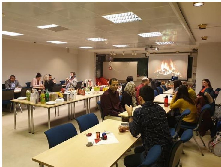
Picture 7. It was a great occasion for socializing.