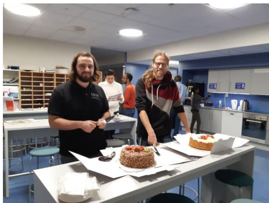
Picture 3. The bowling day was concluded with a pizza party. Picture 4. The pre-Christmas gathering on the Gjøvik campus was accompanied with two yummy cakes.