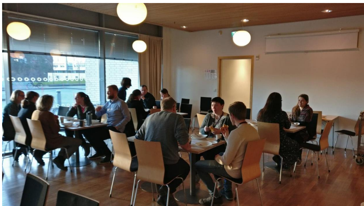
Picture 5. Language Café in Ålesund. Ålesund-based members of DION have already benefited from our DION Grants program.

Speed Lingua – an exciting event for all language enthusiasts! 19 people attended the event representing all departments of the Ålesund campus. The attendees had an opportunity to join a chat at French, German, Russian, Norwegian/English speaking tables and to enjoy vegetarian soup, focaccia, cake and coffee.