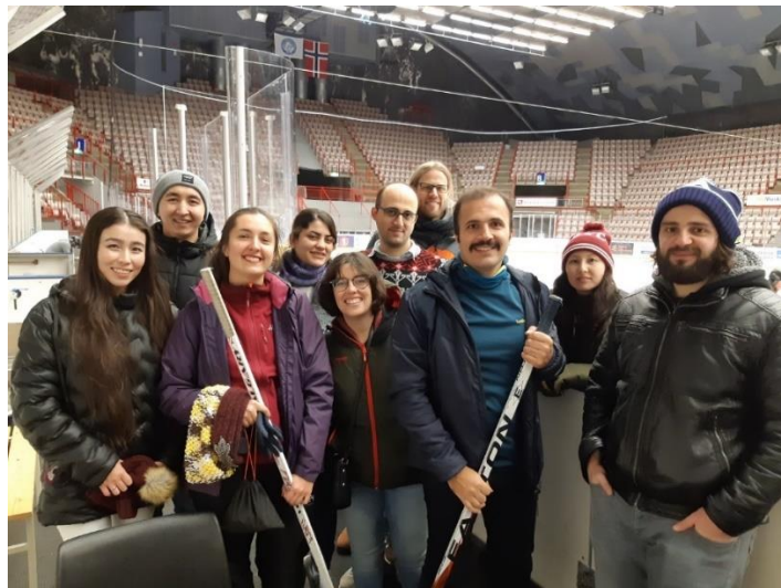
Picture 2. DION Members at Gjøvik Fjellhallen

Finally, Christmassy mood was maintained with a pre-Christmas gathering that is unimaginable without yummy cakes. More than 20 people attended DION Pre-Christmas Gathering event on November 27 th on Gjøvik campus.