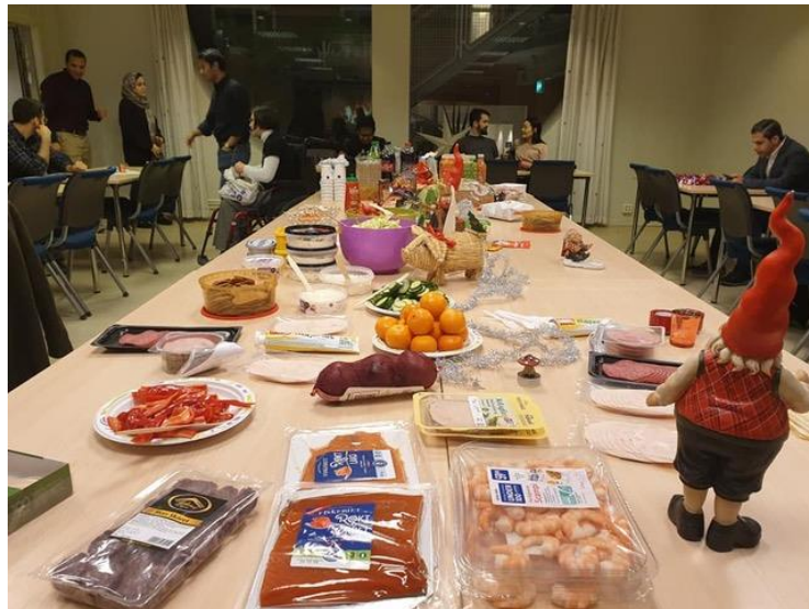
Picture 6. Food and drinks were provided by DION at the event.

On Monday, 16 th of December, we wished each other Merry Christmas at DION's Julebord! We had a lot of food, hot gløgg and many funny games to play together. We can proudly say that the event (for up to 50 participants) went fully booked and it was a great chance to socialize and relieve some stress from the last working days.