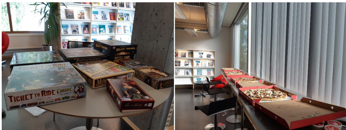
Picture 6: In addition to a great selection of board games, DION members could indulge themselves in a yummy pizza.