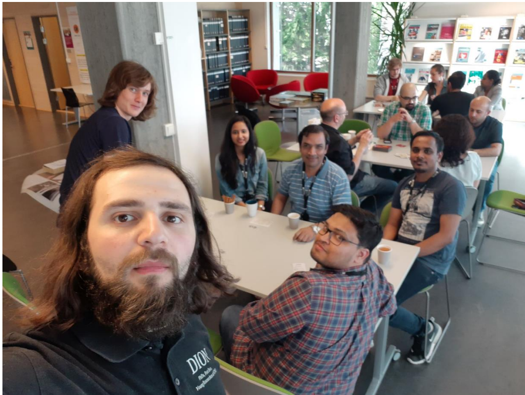
Picture 5: Gjøvik-based members enjoying various board games in the NTNU Gjøvik Library.

The Spring 2019 semester was concluded on June 28 th with traditional Happy Hour in Gjøvik. DION hosted a board games event at the NTNU Gjøvik Library in collaboration with Gjøvik Tabletop, where 15 DION board members could demonstrate their Exploding Kittens' skills, in addition to enjoying free pizza, indeed. 😊