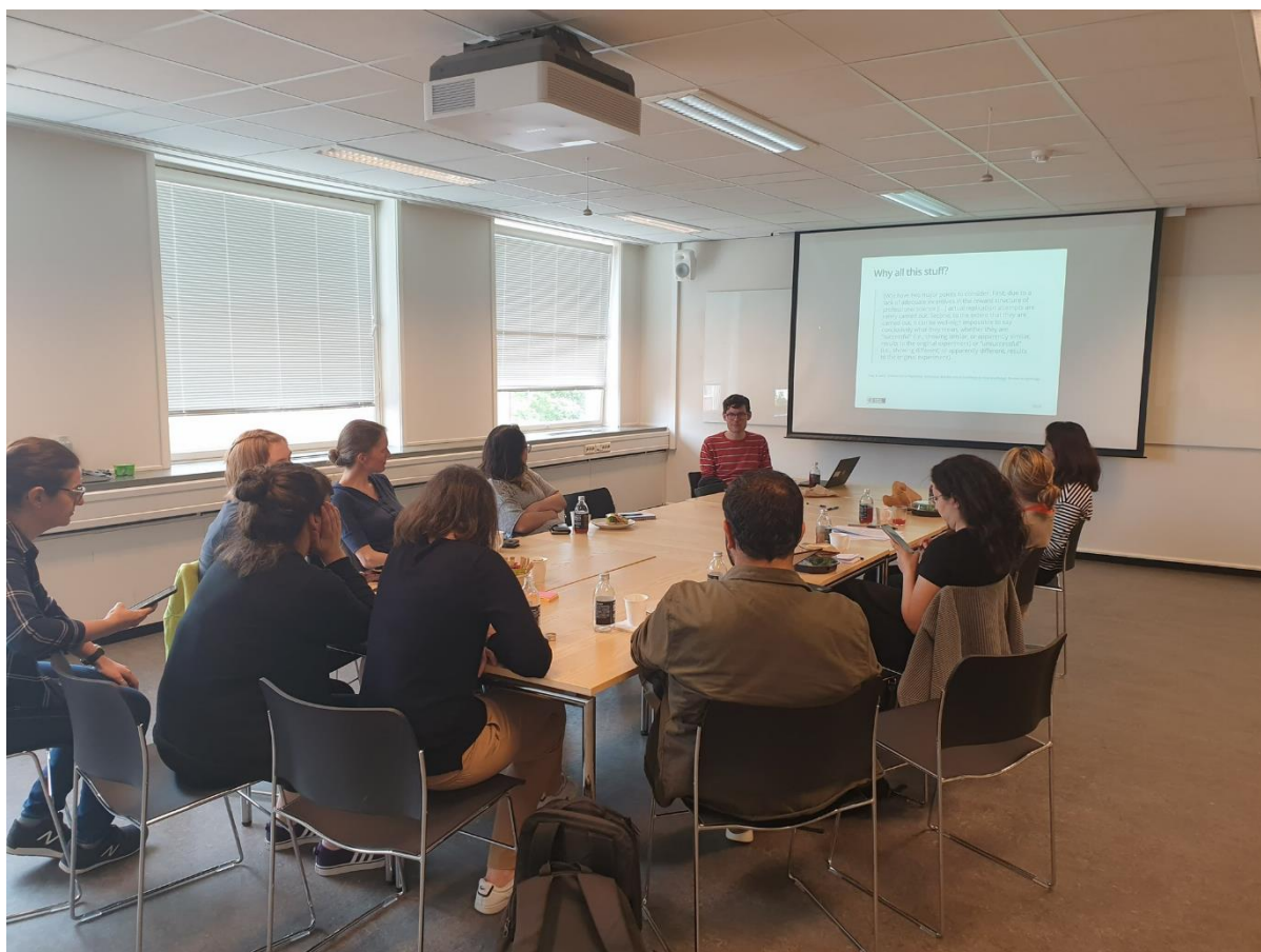
Picture 7: The topic of research in the Digital Era aroused much curiosity among attendees.

We want to thank Dimitra Christidou once again for organizing the informal seminar!