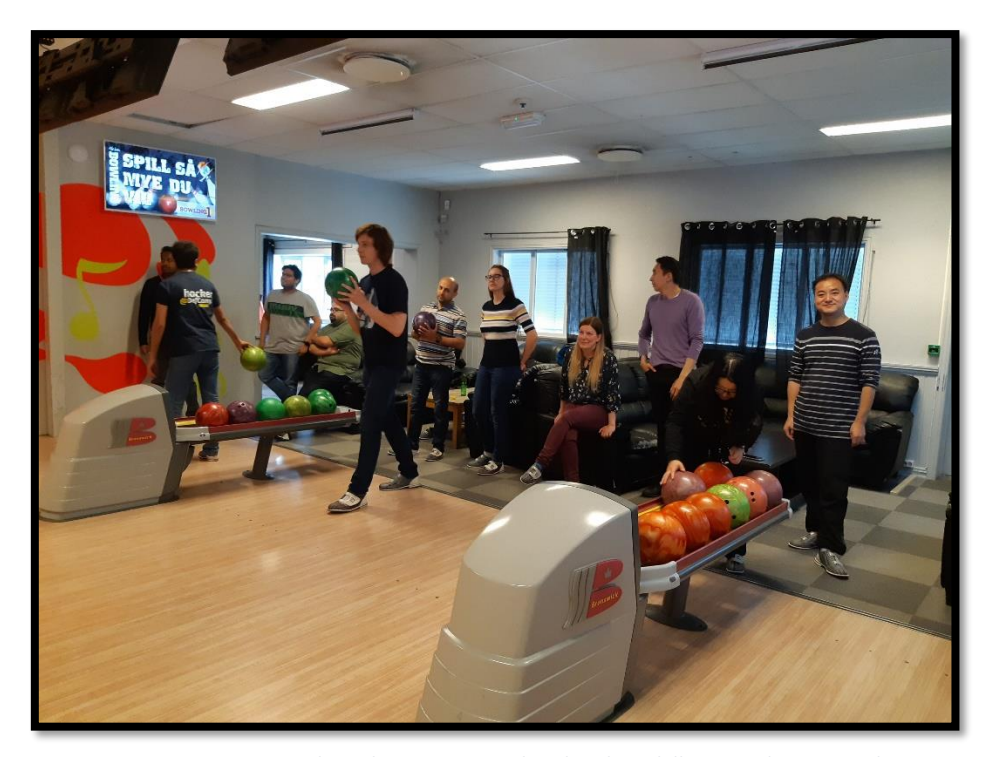
Picture 5: DION members demonstrating their bowling skills at Bowling 1 Gjøvik.

DION arranged another fun activity for its members in Gjøvik. On 26<sup>th</sup> of May, 12 DION members had an opportunity to try their bowling skills and spend an entertaining Sunday evening in company of colleagues from various departments.